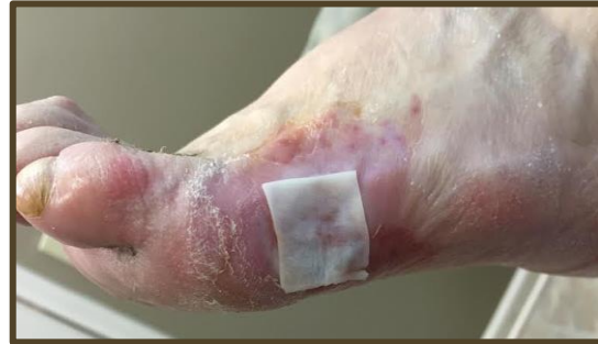
Application of bio-ConneKt®