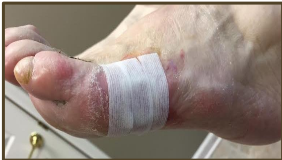
Secured in place with physician's choice