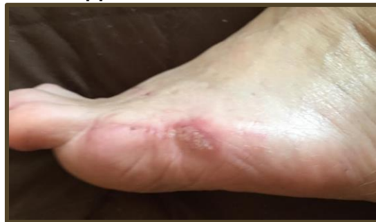
One Application - 6 weeks - Full closure

The bio-ConneKt® Wound Matrix is versatile, easy to use in a variety of clinical settings (in-patient, out-patient, physician's office, etc.), and has been reported by clinicians to help close most commonly seen chronic wounds with one application of the product. In these cases, after the initial wound bed preparation and product application, patients only undergo secondary dressing changes during scheduled follow-up visits until full wound closure. The product is qualified to be reimbursed in most civilian and all military (active & veterans) clinical settings, is wound vac compatible, and is in the High Tier reimbursement bucket through CMS.